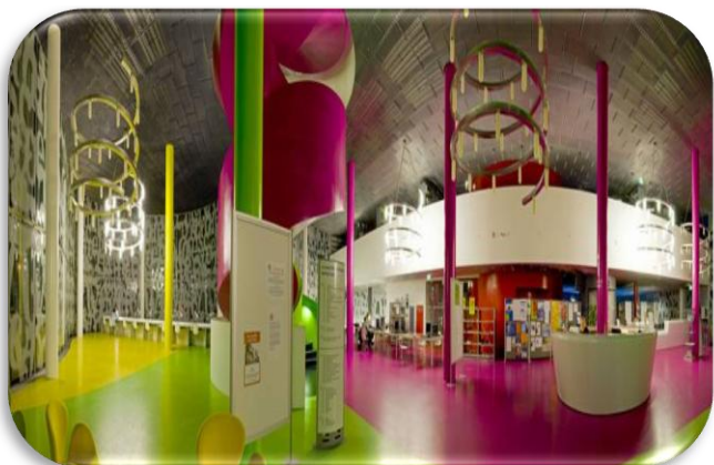
The Library Brandenburg University of Technology Cottbus-Senftenberg

The University library has over 1,192,393 books and 780360 different scientific monographs, 588 printed journals, 21802 E journals, regional and international magazines and periodicals, Microfiche, video, maps, diskettes, CD ROM's in addition to standard printed text are available. The library also won Deutschland Land Der Iden Award, Library of the year award by Bibliothek des jahres 2006 (Library of the Year), and German Architecture Award 2007.