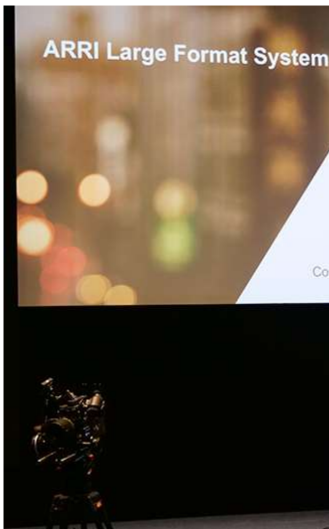
ARRI presented its recent large format sensor camera. Alexa LF