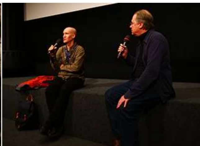
Discussion moderated afterwards by Axel Block and Benjamin B.