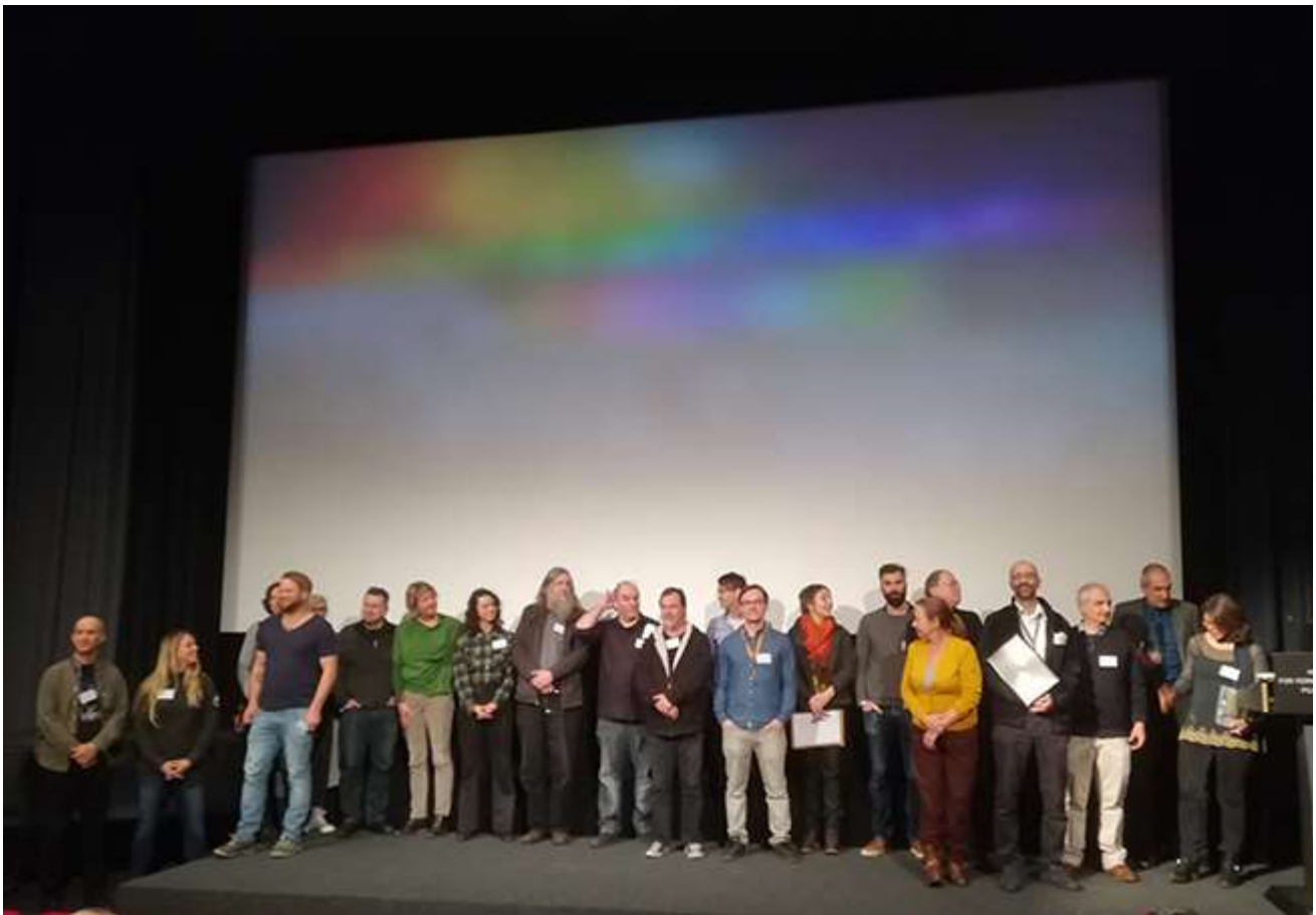
On stage all lecturers of the Hands On xK International

To put up a full week of seminars and workshops is already a tradition in the HFF Film and Television School in Munich. Every year in March during the semester vacation, studios, auditoriums and the facilities are open to receive dozens of lecturers and professionals for a full week on experimenting equipment and to interchange knowledge. The concept is not so much directed to students but to professionals and teachers to improve knowledge, to get acquainted with new equipment, new trends and most of all to learn from each other's.